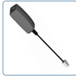
Figure 4 Phone Line Filters (3)