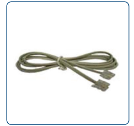
Figure 6 Phone Cord