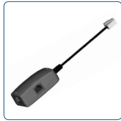
Figure 3 Phone Line Splitter