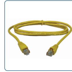
Figure 5 Ethernet Cable