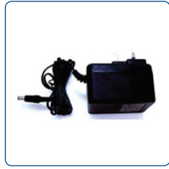
Figure 2 Modem Power Supply